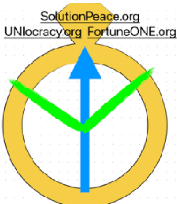
SolutionPeace.org New Our Symbol

As a reminder here is the list of teen self-made jobs we will discuss!